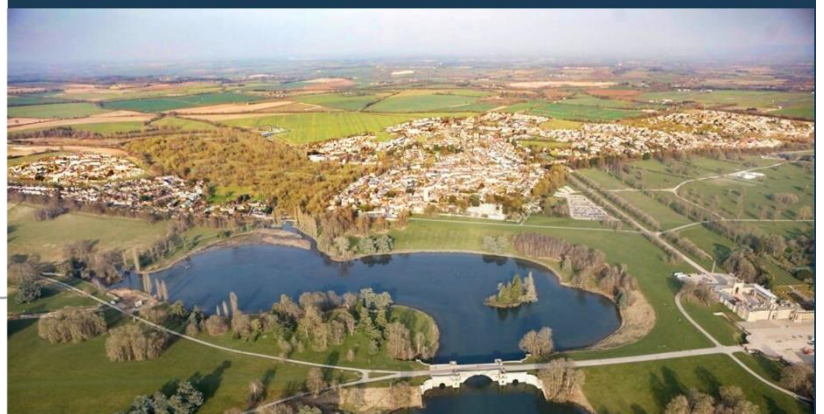
Woodstock, after Park View and the current planning proposals at Hill Rise, Banbury Road and nr Bladon roundabout.

(artist impressions, original photography has been edited)