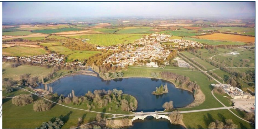
Woodstock, before Park View